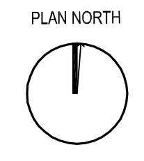
1 LOW ROOF PLAN M103 SCALE: 1/8" = 1'-0"

DUCT DIMENSION NOTE: NOTE: DUCT SIZES INDICATED ARE CLEAR INSIDE DIMENSIONS. INCREASE SHEET METAL DUCT SIZES AS REQUIRED TO ALLOW FOR 1 INCH INTERNAL DUCT LINING.